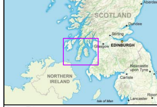
Figure Title Cumulative ZTV: Proposed Development, Beinn an Tuirc Wind Farm Phase 1 and Breackerie Wind Farm