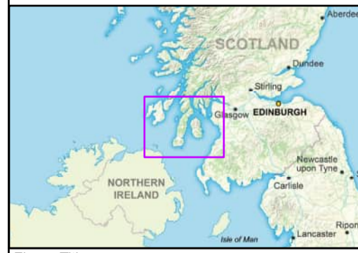
Figure Title Cumulative ZTV: Proposed Development, Eascairt Wind Farm and Earraghail Wind Farm